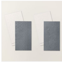
Glass & Gardens Embossing Folders - 165597