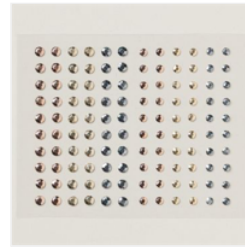
Adhesive-Backed Metallic Gems - 163780