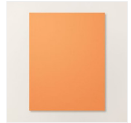
Timid Tiger 8-1/2" X 11" Cardstock - 165626