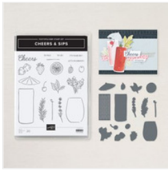
Cheers & Sips Bundle (English) - 165594