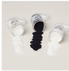
Basics Wow! Embossing Powder - 165679