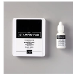
Uninked Stampin' Pad & Whisper White Refill - 147277