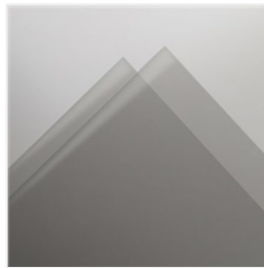
Window Sheets - 142314